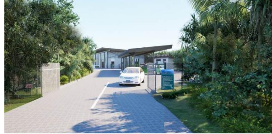
SOUTH ZONE WASTE MANAGEMENT FACILITY MASTER PLAN